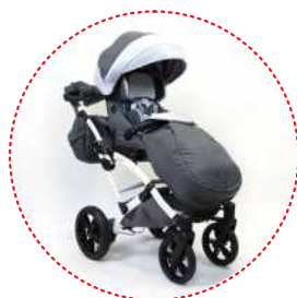
winter sleeping bag