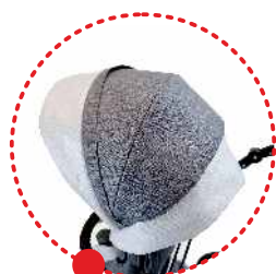
Canopy with window torso / head pads