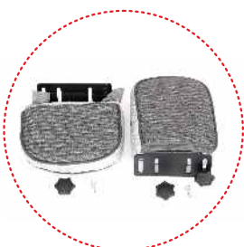
head / torso adjustable pads