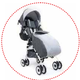
winter sleeping bag