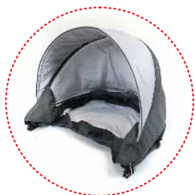
big canopy with window