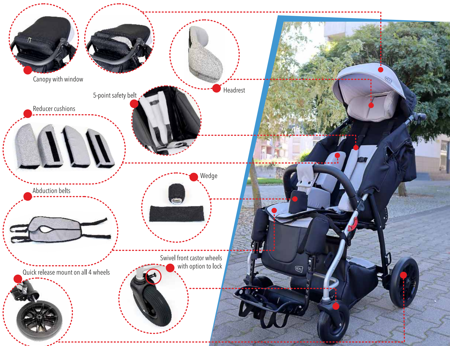
Canopy with window