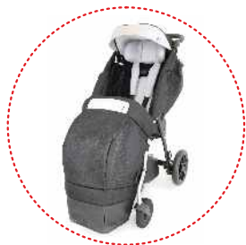
winter sleeping bag