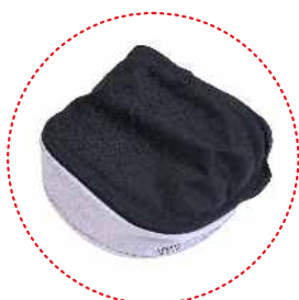
canopy with window